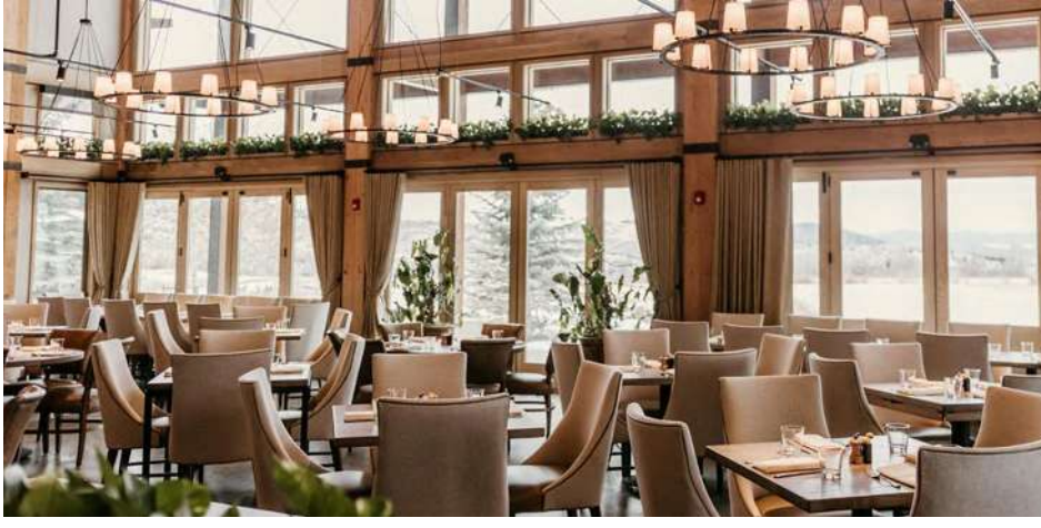
PIONEER KITCHEN $3,000+ | 150 GUESTS MAX