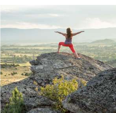
YOGA HIKE 16 GUESTS MAX.

Design your own team-building adventure! With a range of difficulty ratings, our ropes course has two levels: one at 25 feet, and another at over 40 feet. Safety harnesses and Quick-Clic technology allow you and your group to move freely across these 40+ elements!