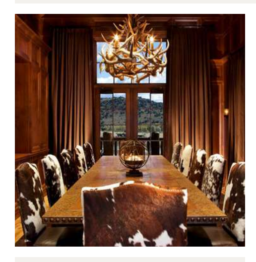
CORRIENTE PRIVATE DINING ROOM $500+ | 14 GUESTS MAX.