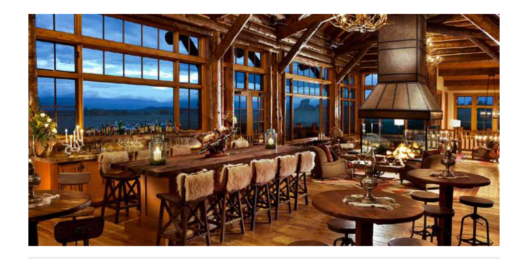
TRAILHEAD GREAT ROOM $3,000+ | 100 GUESTS MAX.