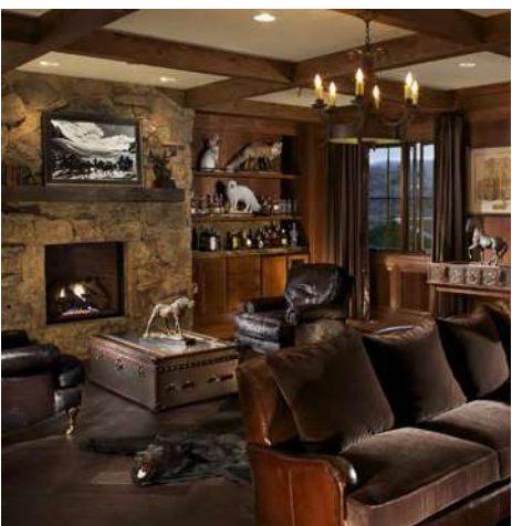
CATTLE BARON'S LIBRARY $1,500+ | 16 GUESTS MAX