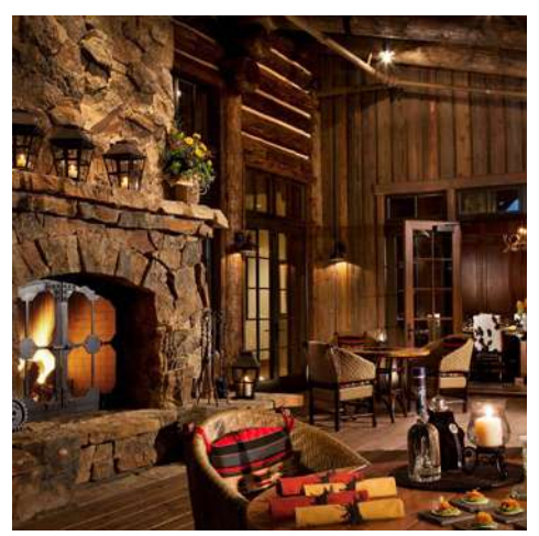
TRAILHEAD PATIO $1,000+ | 16 GUESTS MAX.