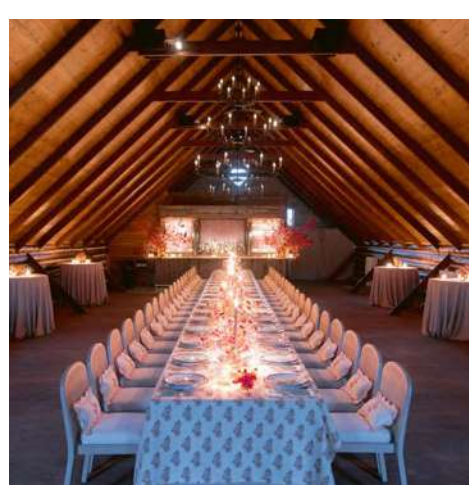
COWBOY CHAPEL $2,000+ | 75 GUESTS MAX.