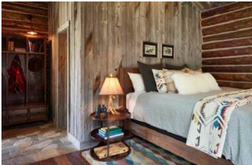
BARCUS 1 King Bed 1 Bathroom Sleeps 2