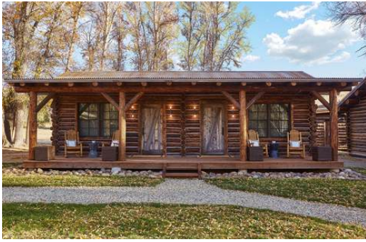
BENNET 1 King Bed 1 Bathroom Sleeps 2